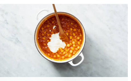
3. Simmer chickpeas

Melt 3 tablespoons butter in a medium Dutch oven or pot over medium-high heat. Add onions and cook, stirring, until golden, 5-7 minutes. Stir in chopped ginger and garlic , and 1 tablespoon curry powder ; cook until fragrant, about 1 minute. Stir in 2 tablespoons tomato paste and cook until paste is brick-red, 1-2 minutes.