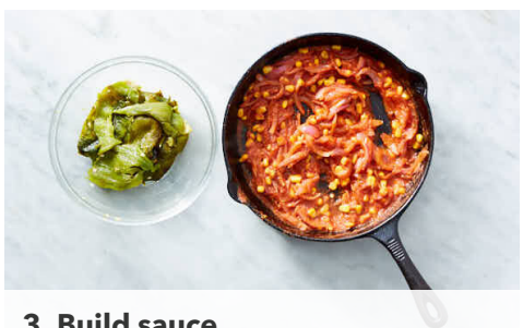
3. Build sauce

Halve and thinly slice all of the onion; finely chop 1 tablespoon of the sliced onions. Pick cilantro leaves from stems: thinly slice stems. Halve 3 tortillas (save rest); stack, then thinly slice into 1/4-inch wide strips. Combine 2 large eggs and a pinch of salt in a medium bowl. Whip with an electric mixer until eggs are thick, lightened in color, and doubled in volume.