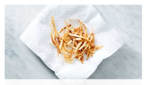
5. Fry tortilla chips

Melt 1 tablespoon butter in a medium ovenproof skillet (preferably cast-iron) over medium-high heat. Add sliced onions and cook until softened, about 5 minutes. Add cilantro stems, tomato sauce, corn, 2 teaspoons cumin, and a pinch of sugar. Cook until slightly reduced, 3 minutes. Peel and discard skin. from peppers , then tear peppers in half lengthwise; discard stems and seeds.