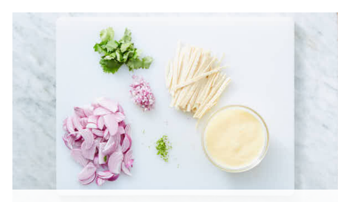
2. Prep ingredients

Transfer half of the sauce from skillet to a small bowl. Spread sauce in skillet to an even layer, then top with peppers and sprinkle with 3/3 of the cheese. Spread remaining sauce over top of cheese. Gently spread egg batter evenly over top layer of sauce, then sprinkle with remaining cheese. Bake casserole on upper oven rack until golden brown and crisp, 35-45 minutes.