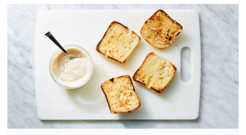
5. Make sauce & toast rolls

Meanwhile, form falafel into 2 equalsized patties, pressing lightly. Heat ½inch oil in a medium nonstick skillet over medium-high. Once oil is shimmering (should sizzle vigorously), add falafel patties and cook until browned, 3-4 minutes. Carefully flip patties and press to flatten; cook, 3-4 minutes more. Transfer to a paper towel-lined plate and sprinkle with salt.