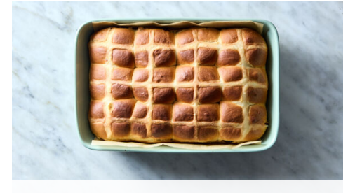
5. Make crosses & bake

Remove buns from fridge; let come to room temperature, covered, and proof until they just touch one another, 2-3 hours.