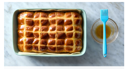
6. Make glaze & serve

Bake on center oven rack until golden brown and 200°F internally, 28-33 minutes. Let cool for 10 minutes.