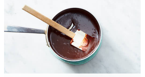
5. Make chocolate glaze

While cake bakes, coarsely chop pecans . In a small nonstick skillet, combine pecans , 1 tablespoon each of butter , maple syrup , and water , and a pinch of salt . Cook over medium heat, stirring often, until pecans are toasted and coated in glaze, 3-4 minutes (watch closely). Transfer candied pecans to a plate and set aside to cool completely.