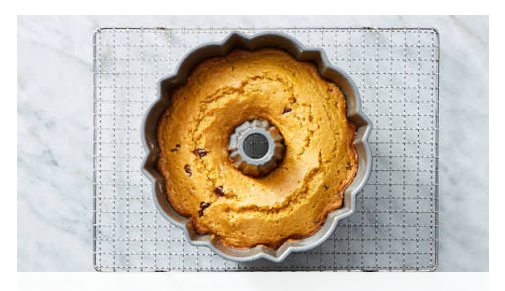
3. Bake cake

In a large bowl, combine sugar and 10 tablespoons softened butter. Use a hand-held mixer to beat until light and fluffy, about 2 minutes. Add 2 large eggs; mix until combined. Scrape down sides of bowl, add 3/3 cup pumpkin and 1 teaspoon vanilla; mix until combined. Mix in half of the flour mixture, then 3/4 cup milk. Add remaining flour mixture and mix until smooth.