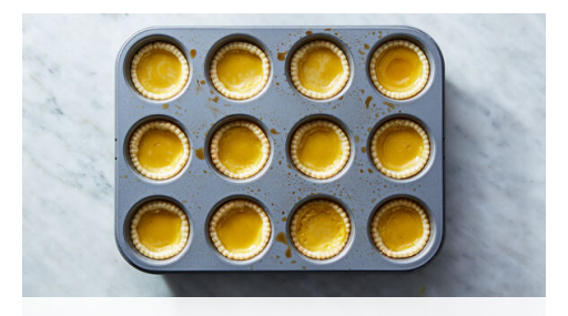
5. Fill tarts & bake

Preheat oven to 400°F with a rack in the center.