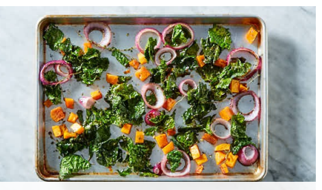
3. Finish vegetables

Transfer onion , squash , and half of the thyme sprigs to a rimmed baking sheet (save rest for own use). Toss vegetables with 1 tablespoon oil , salt , and pepper . Roast vegetables until tender and browned in spots, 20-25 minutes, stirring once halfway through. Discard thyme sprigs.