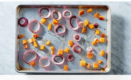
2. Roast vegetables

Preheat oven to 425°F with a rack in the upper third. Peel red onion , then cut into 1-inch slices and separate into rings. Cut butternut squash into ½-inch pieces, if necessary. In a medium bowl, whisk honey , 2 tablespoons vinegar , and 3 tablespoons oil until combined. Season to taste with salt and pepper ; reserve for step 3.