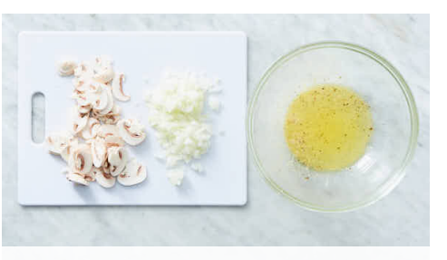
3. Prep gravy, make dressing

In a small bowl, combine poultry seasoning and ½ cup melted butter. Brush cauliflower all over with ⅓ of the seasoned butter; season with salt and pepper. Roast on lower oven rack, brushing cauliflower with remaining seasoned butter and basting with any pan juices every 30 minutes, until cauliflower is tender and slightly charred, about 1½ hours total.