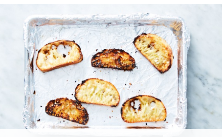
3. Make garlic toast

Cut tomatoes into ½-inch pieces. Pick parsley leaves from stems; discard stems. Coarsely chop parsley leaves . In a small bowl, combine tomatoes , parsley , 1 tablespoon golden balsamic vinegar , 14 of the chopped garlic , and 2 tablespoons oil . Season to taste with salt and pepper ; let sit until step 6.