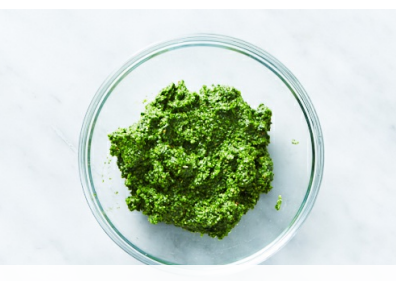
4. Make pesto

Cut roll into ½-inch slices, brush on both sides with oil , and place on a foil-lined baking sheet. Broil on top oven rack until toasted, flipping once, about 1 minute per side (watch closely as broilers vary). Rub toasted bread lightly with 1 whole garlic clove and season with salt .