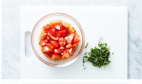
2. Make tomato-parsley salad

Bring a large saucepan of salted water to a boil. Cover and keep warm over low heat. Strip kale leaves from stems , discarding stems, and coarsely chop leaves. Finely chop 1 large garlic clove . Coarsely grate all of the Parmesan on large holes of a box grater. Preheat broiler with a rack in the top position.