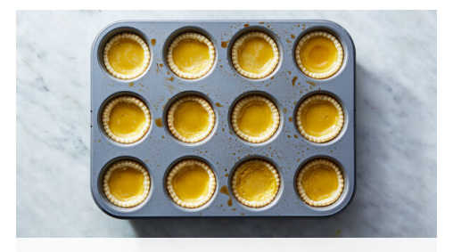
5. Fill tarts & bake

Preheat oven to 400°F with a rack in the center.