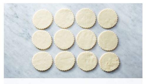
3. Cut dough

Into cooled sugar mixture, whisk in 2 large whole eggs plus 2 large egg yolks (save whites for own use), 1 teaspoon vanilla extract, and ¼ teaspoon salt until mixture is smooth and well combined. Strain mixture through a fine-mesh sieve into a measuring cup. Cover with plastic wrap and refrigerate for at least 1 hour or up to 48 hours.