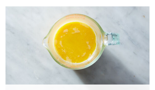
2. Mix custard

In a small saucepan, combine ½ cup each of sugar and water. Set saucepan over medium-high heat; cook, whisking, until sugar is dissolved. Remove from heat, then whisk in ¼ cup evaporated milk; set mixture aside until cooled to room temperature.