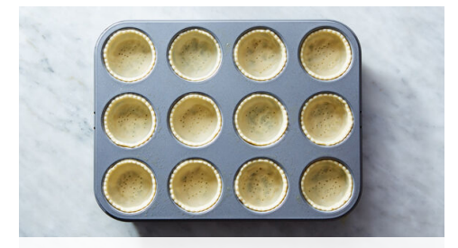
4. Chill tart dough

Unroll dough onto a floured work surface; roll to an ½-inch thickness, smoothing any cracks in the dough. Using a 3¾-inch round cookie cutter, cut 12 circles of dough (save scraps for another use).