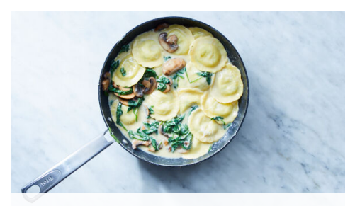
3. Make sauce

Add ravioli to boiling water (if stuck together, gently pull apart only if possible without tearing). Reduce heat and simmer gently, stirring occasionally, until al dente, 3-4 minutes. Reserve 1 cup cooking water ; drain pasta.