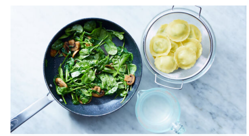
2. Cook ravioli

Heat 1 tablespoon oil in a medium skillet over medium-high. Add mushrooms, season with salt and pepper , and cook, stirring occasionally, until mushrooms are golden brown, 4-5 minutes.