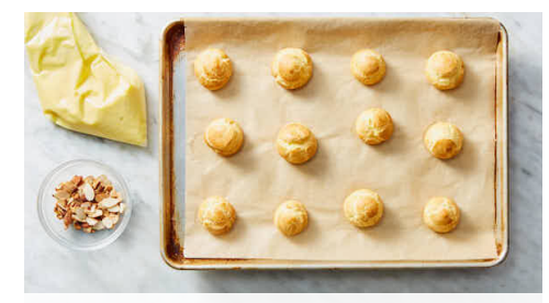
5. Bake cream puffs

Transfer pâte à choux to bowl of a stand mixer with a paddle attachment; mix on low to cool, about 2 minutes. Increase speed to medium, slowly pour in eggs , mixing until well combined. Scrape choux into a sealable plastic bag; cut a ½-inch triangle off 1 corner. Pipe 12 rounds onto a parchment-lined baking sheet, about 2-inches apart. Use the back of a spoon to smooth out tops of rounds.