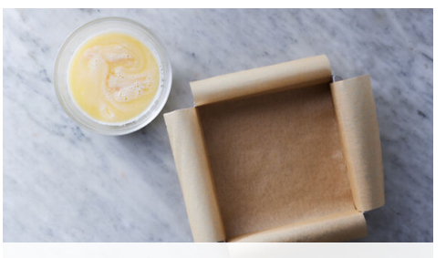
1. Prep baking dish

Calories 400kcal, Fat 20g, Carbs 45g, Protein 10g