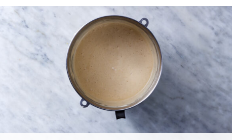
3. Mix batter

To the bowl of a stand mixer fitted with the whisk attachment, add ¾ cup sugar and 4 cold large eggs . Whip on high speed until pale, doubled in volume, and thick enough to briefly mound up on itself when dropped from whisk, 7-10 minutes.