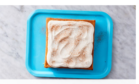
6. Whip topping & serve

Meanwhile, in a measuring cup, whisk together remaining whole milk , 3/4 cup evaporated milk , 3/3 cup condensed milk , and 1/2 teaspoon vanilla . Using a skewer, poke holes at 1/2-inch intervals over top of cake . Slowly pour milk mixture over warm cake until completely absorbed. Let sit at room temperature 15 minutes, then refrigerate uncovered for at least 3 hours or up to 24.