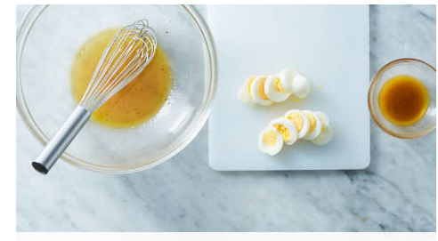
5. Make dressing

While croutons bake, trim cucumber (peel, if desired), then halve lengthwise, scoop out seeds, and cut into ½-inch pieces. Core tomato and cut into ½-inch pieces. Halve lettuce lengthwise, then cut crosswise into ½-inch slices, discarding end.