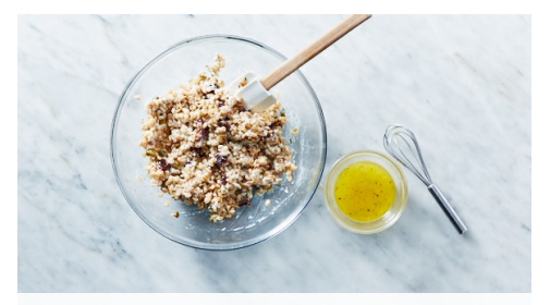
5. Dress grains

Transfer roasted lemon wedges to a medium bowl and press with a spoon to squeeze juice; discard rind and seeds. Whisk in 2 tablespoons oil, 1 tablespoon water, and 3/3 of the feta. Season to taste with salt and pepper.