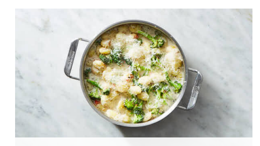
4. Make sauce

In same skillet set over medium heat, combine all of the cream cheese, garlic, 1 cup water, and 1½ teaspoons Italian seasoning; whisk until smooth. Season to taste with salt and pepper.