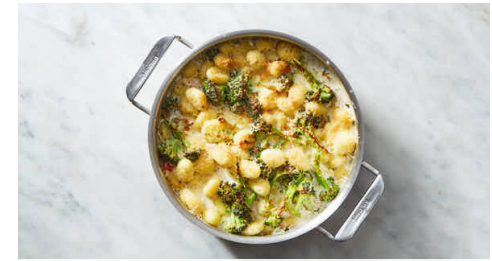
5. Broil gnocchi

Remove from heat; stir in gnocchi , broccoli , fontina , and roasted peppers . Sprinkle top with half of the Parmesan .