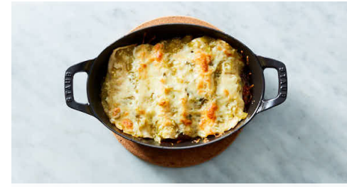
5. Bake enchiladas

Wrap tortillas in a damp paper towel and microwave until softened, 30-40 seconds. Arrange tortillas on a work surface. Divide filling among each and roll up tightly. Arrange in prepared baking dish, seamside down