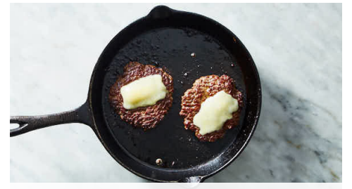
5. Cook burgers

Lightly brush cut sides of buns with oil . Heat a medium skillet over medium-high. Add buns, oiled sides down, and toast until lightly browned, 1-2 minutes (watch closely). Transfer buns to plates. Coarsely chop all of the cheese .