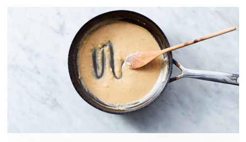
6. Make dressing & serve

Heat 2 tablespoons shallot oil in reserved skillet over medium-high until shimmering. Carefully add tofu , season with salt , and cook, turning occasionally, until golden, 5–8 minutes. Transfer to a plate.