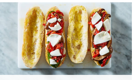
4. Assemble panini

In a medium bowl, whisk together 2 tablespoons oil and 1 tablespoon vinegar; season generously with salt and pepper.