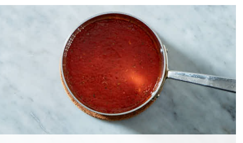
3. Make tomato sauce

Add zucchini, mushrooms, red peppers , and half of the garlic to bowl with dressing .