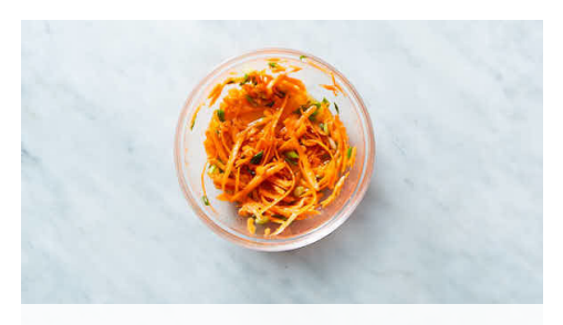
3. Pickle carrots

In a small saucepan, combine rice , 11/4 cups water , and 1/2 teaspoon salt Bring to a boil over high heat, then cover and cook over low until rice is tender and water is absorbed, about 17 minutes. Remove from heat and keep covered until ready to serve.