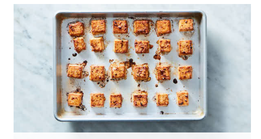
4. Broil tofu

While rice cooks, scrub and coarsely grate carrot. Trim scallions, then thinly slice about ¼ cup. In a medium bowl, whisk to combine 1 tablespoon each of oil and vinegar, ¼ teaspoon sugar, and a pinch of salt. Add carrots and half of scallions to bowl, stirring to combine. Set aside until ready to serve.