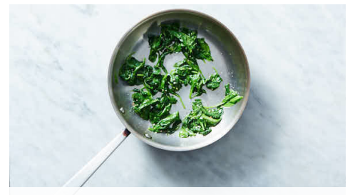
5. Sauté spinach

Generously oil a rimmed baking sheet. Lift tofu from marinade and arrange on prepared baking sheet; reserve marinade. Season tofu with salt and pepper . Broil on center oven rack until browned in spots, 10-15 minutes (watch closely as broilers vary). Remove from oven and carefully pour reserved marinade over tofu.