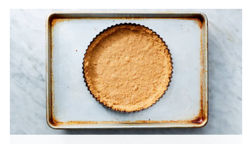
2. Bake crust

Preheat oven to 375°F with a rack in the center. In a medium saucepan, melt 6 tablespoons unsalted butter over medium heat. In a medium bowl, combine graham cracker crumbs, melted butter, ¼ cup sugar, and ½ teaspoon salt. Stir with a fork until it resembles sand (it should clump like a crumb topping when pinched). Reserve saucepan for step 3.