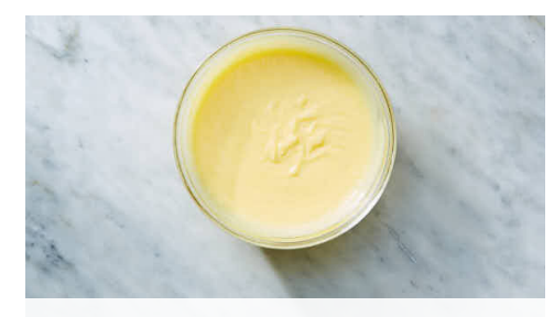
4. Cook lemon curd

Meanwhile, in reserved saucepan, combine 4 large whole eggs and 2 large egg yolks (save whites for own use). Finely grate 2 tablespoons lemon zest (about 3 lemons) and squeeze ½ cup lemon juice (4-5 lemons) into same saucepan. Whisk in 1 cup sugar and ½ teaspoon salt until completely combined and sugar is dissolved.