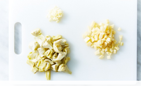
2. Prep ingredients

Preheat oven to 425°F with a rack in the center. Scrub sweet potato , then cut into ½-inch thick wedges. On a rimmed baking sheet, toss sweet potatoes with 1 tablespoon oil and season with salt and pepper . Roast on center oven rack until brown and tender, tossing halfway through, about 20 minutes total.