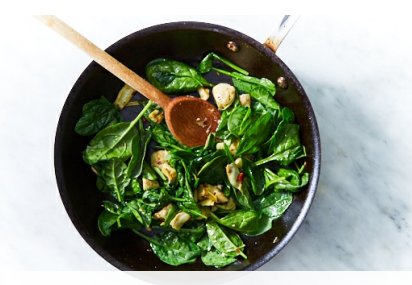
4. Wilt spinach

Heat 1½ tablespoons oil in a medium nonstick skillet over medium-high. Add chopped garlic, artichokes, and a pinch of crushed red pepper (or more depending on heat preference); season with salt and pepper. Cook, stirring, until garlic is fragrant and artichokes start to brown, about 4 minutes.