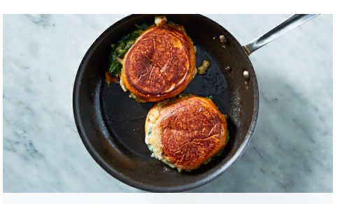
6. Finish & serve

Add cheese to bowl with spinach artichoke mixture and toss gently to combine; season to taste with salt and pepper . Split buns in half and lightly brush all sides with oil . Divide mixture between buns and close. Heat 2 teaspoons oil in same skillet over medium.