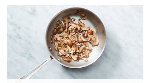
2. Sauté mushrooms

Finely grate all of the Parmesan , if necessary.