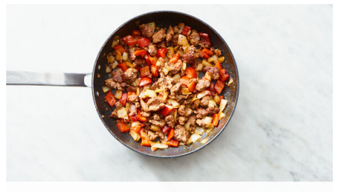
3. Cook veggies

Heat 1 tablespoon oil in a medium skillet over medium-high. Add Actual Veggies patties and a pinch each of salt and pepper . Cook, breaking veggie ground up into smaller pieces, until well browned, 5-7 minutes.