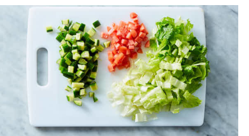
4. Prep salad

Preheat oven to 450°F with a rack in the upper third. Place 2 large eggs in a small saucepan. Add enough water to cover by 1 inch. Bring water to a boil over high, then cover and remove from heat until eggs are set, about 10 minutes. Use a slotted spoon to remove eggs from saucepan and place in a bowl of ice water.