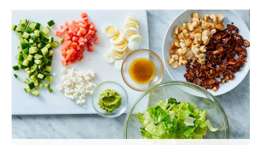
6. Assemble salad & serve

Once eggs are cool, peel and slice crosswise into ¼-inch thick rounds. In a large bowl, whisk to combine ¼ cup oil and 2 tablespoons vinegar ; season to taste with salt and pepper . Transfer 3 tablespoons of the dressing to a small bowl.