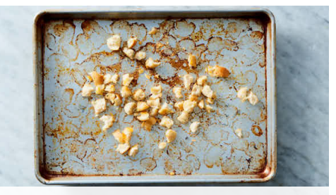
3. Bake croutons

While eggs cook, trim mushrooms and thinly slice caps. On a rimmed baking sheet, toss mushrooms with 2 tablespoons oil, BBQ spice blend, a generous pinch of salt , and a few grinds of pepper . Roast mushrooms on upper oven rack until deep golden-brown and starting to crisp, about 20 minutes. Transfer to a plate.