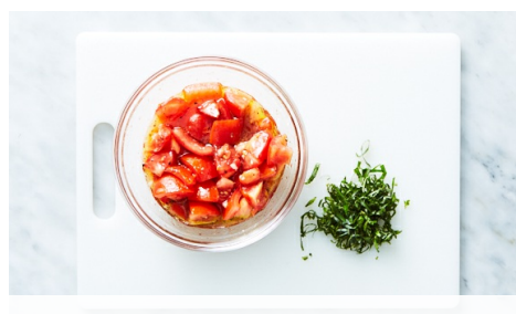
2. Make tomato-parsley salad

Bring a large saucepan of salted water to a boil. Cover and keep warm over low heat. Strip kale leaves from stems , discarding stems, and coarsely chop leaves. Finely chop 1 large garlic clove . Coarsely grate all of the Parmesan on large holes of a box grater. Preheat broiler with a rack in the top position.