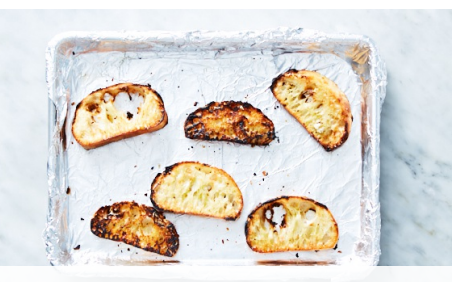
3. Make garlic toast

Cut tomatoes into ½-inch pieces. Pick parsley leaves from stems; discard stems. Coarsely chop parsley leaves . In a small bowl, combine tomatoes , parsley , 1 tablespoon red wine vinegar , ¼ of the chopped garlic , and 2 tablespoons oil . Season to taste with salt and pepper ; let sit until step 6.