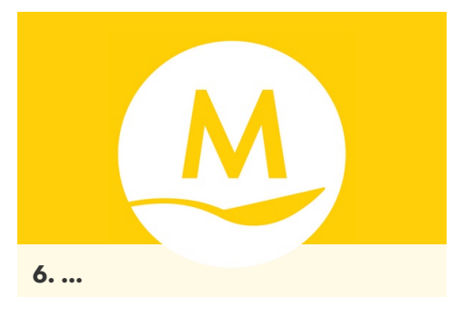
You won't find them here! Enjoy your Marley Spoon meal!