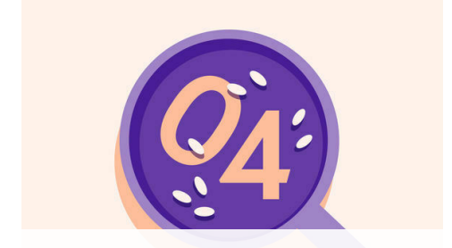
4. Add peas & cheese

Stir ravioli into skillet with sauce . Reduce heat to medium-low and cook, stirring occasionally to prevent sticking, until al dente, about 3 minutes.