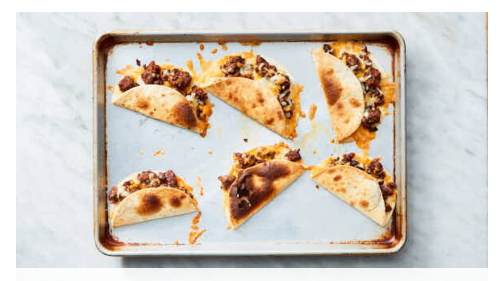
5. Broil quesadillas

In a 2nd small bowl, stir to combine remaining gochujang and tamari, 3 tablespoons water, 1 tablespoon sugar, and 1 teaspoon sesame oil. Set glaze aside until step 3.