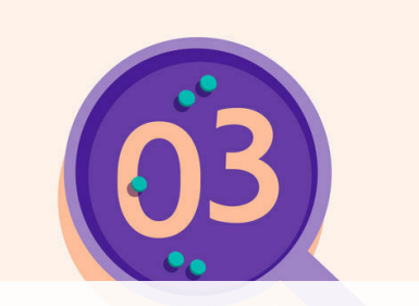
3. Prep glaze

In a medium bowl, whisk together ¼ cup vinegar, 2 tablespoons each of oil and water, 2 teaspoons sugar, and 1 teaspoon salt. Stir in cucumbers; set aside to marinate until ready to serve.