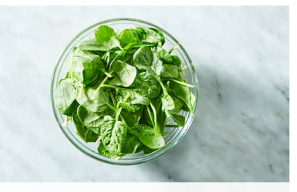
3. Make salad dressing

Meanwhile, in a small bowl, stir to combine mayonnaise and Sriracha .