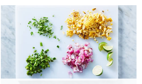
3. Prep salad

Grill poblano and corn (or place directly over a gas flame), and cook, turning frequently, until charred in spots, 4-6 minutes. Wrap poblano in a paper towel and let cool.