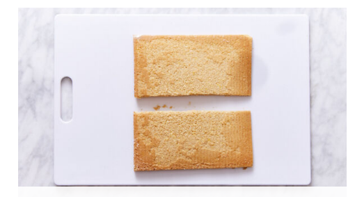
4. Cut cake in half

Transfer cake batter to prepared baking pan; smooth into an even layer with a spatula (batter will be about ½-inch thick). Bake on center oven rack until deeply golden and a toothpick inserted in center comes out clean, 18-22 minutes. Remove from oven. Set cake aside in baking pan and let cool completely, about 30 minutes.