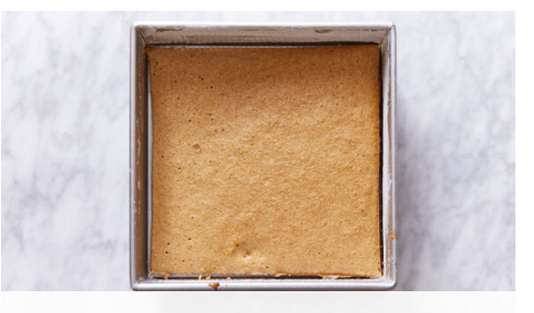
3. Bake cake

Generously butter an 8-inch square baking pan; dust with flour; shake out excess. Finely grate orange zest into a medium bowl. To bowl, add 1 large egg, ½ cup granulated sugar, and 4 tablespoons melted butter; whisk to combine. Stir in ¾ cup cup water; add remaining flour, ¾ teaspoon each of baking powder and cinnamon, and ¼ teaspoon salt; whisk to combine.