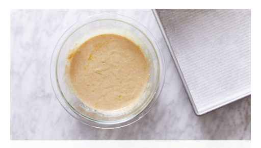
2. Make cake batter

Preheat oven to 350°F with a rack in the center. In a medium bowl, combine mascarpone and 3 tablespoons ricotta, whisking until smooth. Add ¾ cup confectioners sugar, ½ teaspoon cinnamon, and a pinch of salt, whisking until combined. Finely chop ¼ cup chocolate chips, then stir into filling. Cover and place in the refrigerator to chill until step 5.