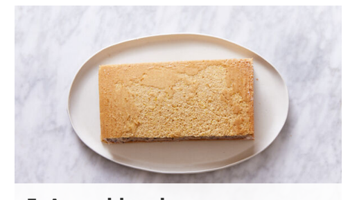
5. Assemble cake

Once cake is cool, turn cake out onto a cutting board; cut in half, making two rectangles. Place 2 tablespoons butter in a small microwave-safe bowl and set out to soften at room temperature until step 6.