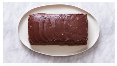
6. Make glaze & serve

Place one cake layer on a cake stand or serving platter. Spread ricotta filling over top of the cake in an even layer, leaving a ½-inch border. Top with second cake layer . Cover and place in the refrigerator to chill for 30 minutes.