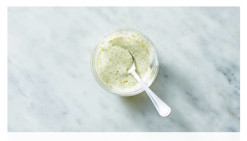
6. Make sauce & serve

Heat 1 tablespoon oil in same skillet over medium-high. Add Actual Veggies™ burgers and cook until well browned on the bottom, 2-3 minutes. Flip burgers, then top each with cheese . Cover and cook until cheese is melted and burgers are warmed through, 2-3 minutes.