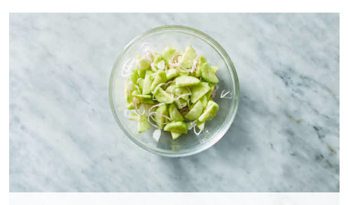
3. Pickle cucumbers

Meanwhile, peel and thinly slice ¼ cup shallot . Peel cucumber , then halve lengthwise, scoop out seeds, and thinly slice crosswise into half-moons.