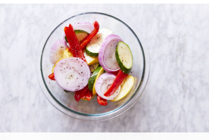
3. Season veggies

Bring a medium saucepan of salted water to a boil. Add farro and cook until tender, 18-20 minutes. Drain well; cover to keep warm off heat until ready to serve.