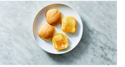
4. Toast buns

In a medium bowl, stir to combine sliced shallots , cucumbers , 1 tablespoon vinegar , and ¼ teaspoon sugar . Season to taste with salt and pepper . Set aside, stirring occasionally, until ready to serve.