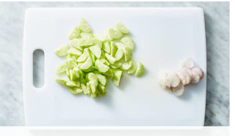
2. Prep pickle ingredients

Preheat oven to 450°F with a rack in the lower third. Scrub potato , then cut lengthwise into ½-inch thick wedges. On a rimmed baking sheet, toss potatoes with 1 tablespoon oil , then season with salt and pepper . Roast on lower oven rack until potatoes are golden and crisp, 23-25 minutes, flipping potatoes halfway through.