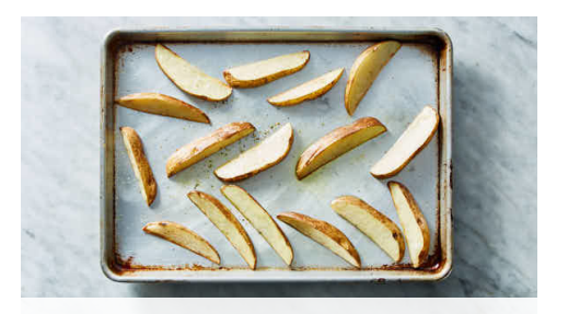
1. Roast potato wedges

Calories 920kcal, Fat 49g, Carbs 90g, Protein 37g