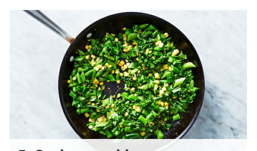
5. Cook vegetables

Heat 1/2 tablespoon oil in a large nonstick skillet over medium-high. Add cashews and cook, stirring frequently, until toasted, 1-2 minutes. Using a slotted spoon, transfer cashews to a paper towellined plate and season with salt. Let cashews cool slightly, then coarsely chop.