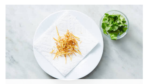
4. Fry ginger

To Dutch oven, add chickpeas and their liquid, ¼ cup water, and a pinch each of salt and pepper; bring to a boil. Simmer over medium heat until sauce is slightly reduced, 5-6 minutes. Stir in yogurt and ½ teaspoon sugar until combined.