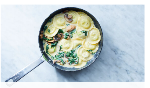
3. Make sauce

Add ravioli to boiling water (if stuck together, gently pull apart only if possible without tearing). Reduce heat and simmer gently, stirring occasionally, until al dente, 3-4 minutes. Reserve 1 cup cooking water ; drain pasta.