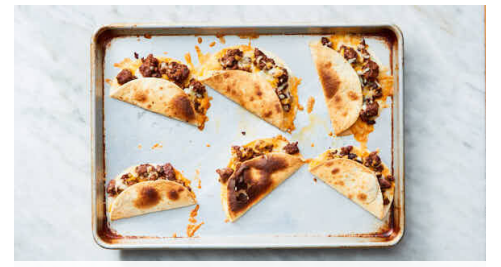
5. Broil quesadillas

Heat 1 tablespoon neutral oil in a medium skillet over high. Add Impossible patties; cook, breaking up into smaller pieces, until heated through and browned, 4-5 minutes, Stir in remaining chopped garlic; cook until fragrant, about 1 minute. Add glaze; cook, scraping up browned bits from skillet, until ground is coated and skillet is mostly dry, 1-2 minutes. Season to taste.