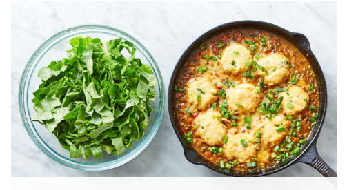
6. Make salad & serve

Dollop 8 tablespoons of cornbread batter over beans, then top with shredded cheddar-jack cheese. Bake on upper oven rack until firm but not golden, 8-10 minutes. Switch oven to broil. Broil until cornbread is firm and golden brown, 1-2 minutes (watch closely as broilers vary).