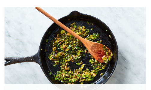
2. Sauté aromatics

Preheat oven to 425°F with a rack in the upper third. Finely chop 1 teaspoon garlic. Trim scallions, then thinly slice, keeping dark greens separate. Halve poblano pepper, discard stem and seeds, then finely chop. Use your fingers or two forks to break up pork into bitesized pieces.