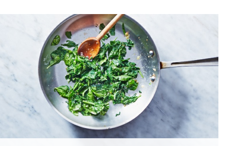
4. Wilt spinach

Meanwhile, heat 1 teaspoon oil in same skillet over medium-high. Add remaining chopped onions and cook, stirring occasionally, until golden, 2-3 minutes.