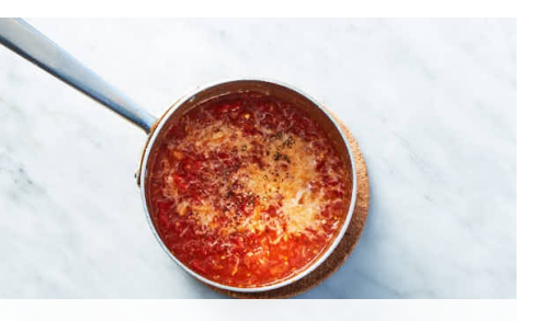
3. Finish sauce

Increase heat to medium-high, then add roasted red peppers , and cook, about 1 minute.