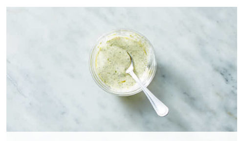
6. Make sauce & serve

Heat 1 tablespoon oil in same skillet over medium-high. Add Actual Veggies™ burgers and cook until well browned on the bottom, 2-3 minutes. Flip burgers, then top each with cheese . Cover and cook until cheese is melted and burgers are warmed through, 2-3 minutes.