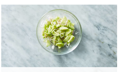
3. Pickle cucumbers

Meanwhile, peel and thinly slice ¼ cup shallot. Peel cucumber, then halve lengthwise, scoop out seeds, and thinly slice crosswise into half-moons.