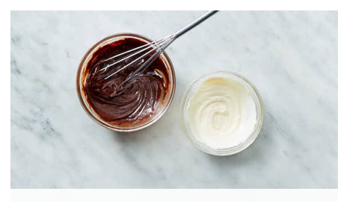
5. Prep chocolate toppings

In a medium bowl, combine cream cheese , all of the sour cream , and remaining sugar . Use electric mixer to beat until very smooth, about 2 minutes. Add ½ teaspoon peppermint extract and 1 large egg ; beat until smooth. Stir in crushed peppermint . Transfer batter to chilled crust ; use a spatula to smooth top. Bake on center oven rack until set, about 30 minutes.