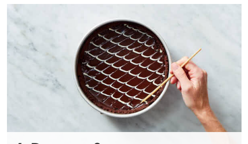
6. Decorate & serve

Let cheesecake cool completely. In a small microwave-safe bowl, add chocolate chips and 1 tablespoon each of milk and softened butter . Microwave until melted, 1 minute, then whisk until smooth; set ganache aside. In a 2nd microwave-safe bowl, microwave white chocolate chips until melted, 1 minute. Transfer white chocolate to a resealable plastic bag; snip off one small corner.