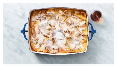
6. Garnish & serve

Place baking dish on a rimmed baking sheet and bake on center oven rack until French toast is puffed, browned, and set in the middle, about 1 hour.